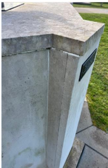
Damaged grout work

Many of you know of the Toc H memorial at the National Memorial Arboretum in Alrewas in Staffordshire. It was one of the first memorials to be constructed on the arboretum site. Which has over 300, 000visistors per year. The memorial has stood the test of time but repairs are currently underway mainly to the grout work of the main panels that make up the Memorial. When the work is complete we will be arranging for the brass and stone work to be cleaned. We have come to an arrangement with the trust to clean and maintain the memorial every year. Donations towards the repairs and ongoing maintenance would be gratefully received.