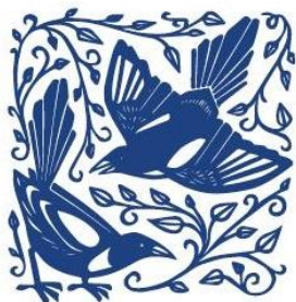
Figure 1 shows a wood cut; if trustees had decided to go with this one the birds would have been replaced with a lamp. This image would have evoked our heritage but also had the capacity to develop a narrative that is current and relative. Trustees felt this was too fussy and complicated to look at which might have left people wondering what sort of organisation we were.

Deciding on a brand which reflects the life and culture of an organisation is always difficult especially when it leaves a much-loved logo behind. After much deliberation the trustees agreed to move to a new brand which clearly indicates the Toc H name. There were five possibilities that were reviewed and they are set out below: